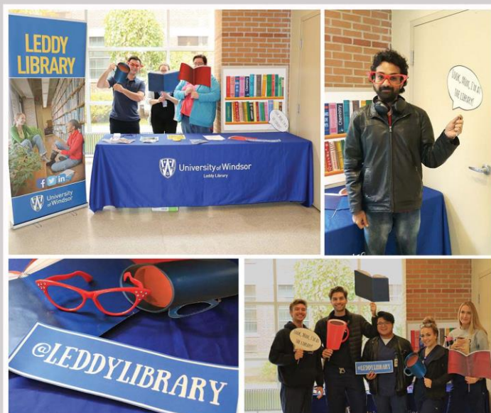
Students and the library team pose for a photo at the pop-up library hosted at the CAW Student Centre.

Leddy Library aims to ensure that students feel welcome and supported throughout their academic journey. The Library regularly participates in campus outreach events including student orientation, spring and fall open houses, as well as themed events such as the campus-wide Treat Trail.